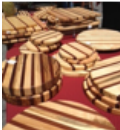
CUTTING BOARDS AND BOWLS FROM AFFINITY WOODWORKS