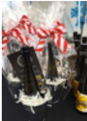
SUNFLOWER OILS AND SUNFLOWER OIL BODY SCRUBS FROM HUDSON VALLEY OILS